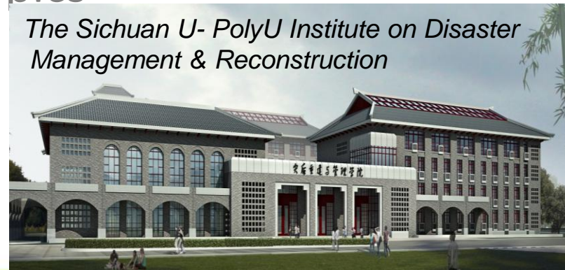
The Sichuan U- PolyU Institute on Disaster Management & Reconstruction